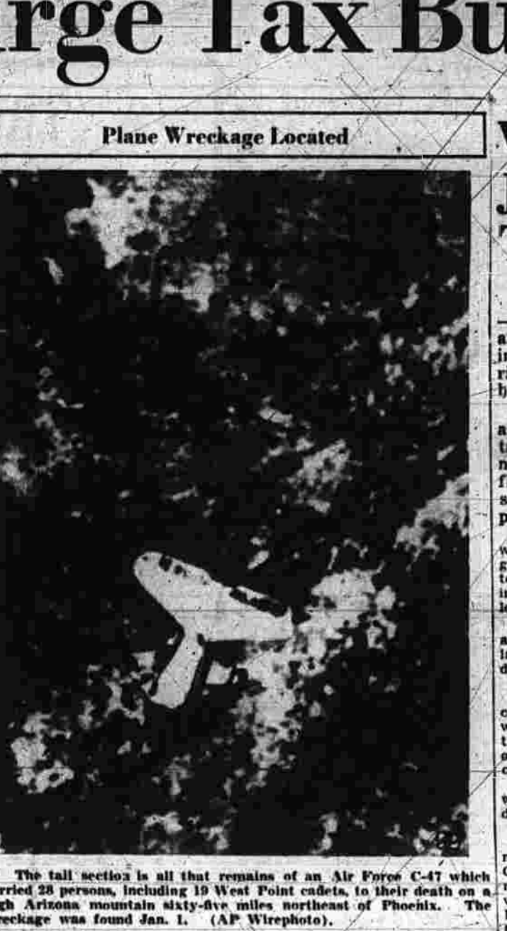
The tall section is all that remains of an Air Force C-47 which carried 28 persons, including 19 West Point cadets, to their death on a high Arizona mountain sixty-five miles northeast of Phoenix. The wreckage was found Jan. 1.